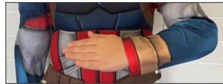
need / want